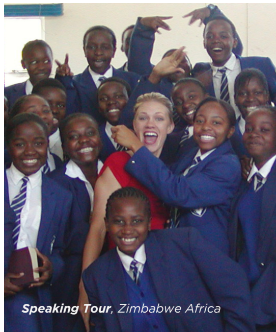
Speaking Tour, Zimbabwe Africa