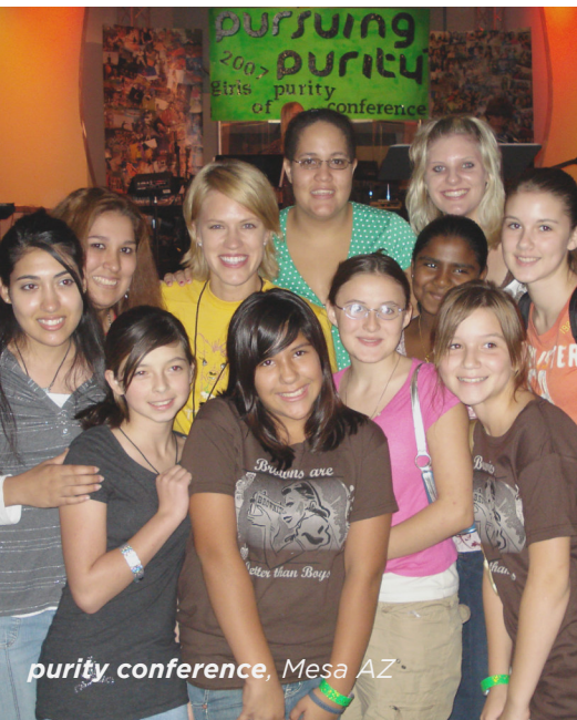
purity conference, Mesa AZ