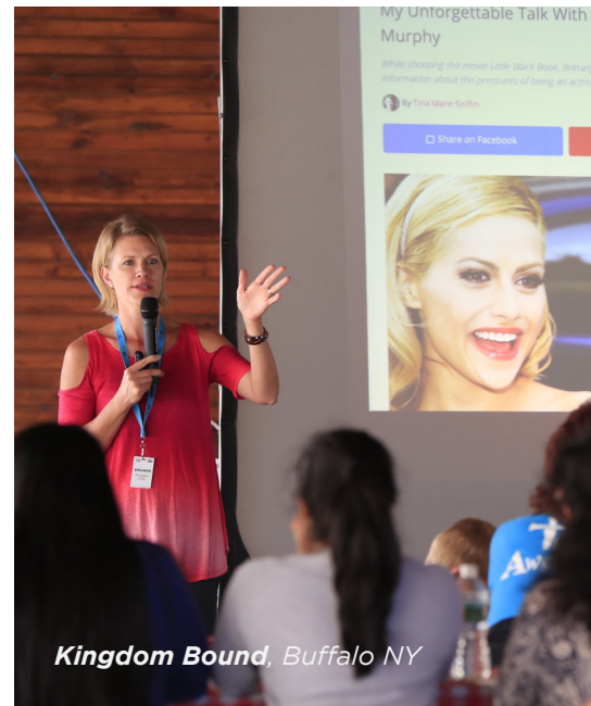
Kingdom Bound, Buffalo NY