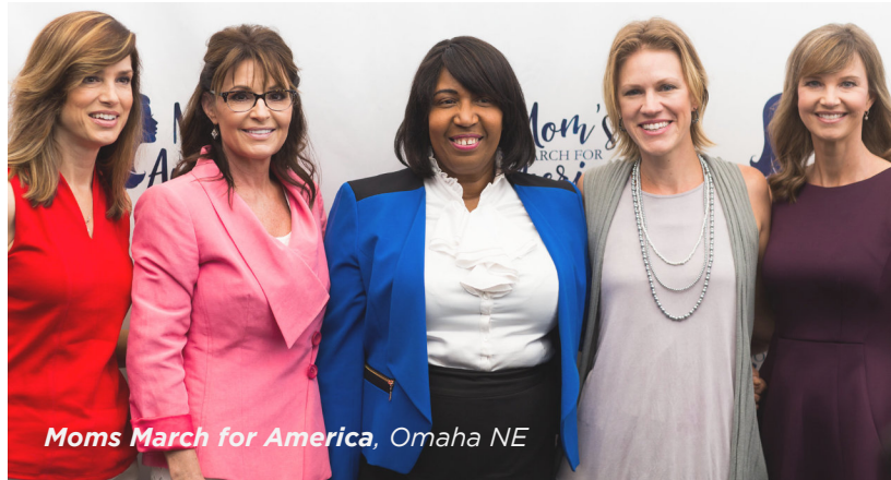
Moms March for America, Omaha NE